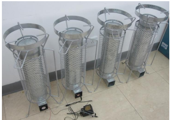
Several Units of the Stove Ready for Use