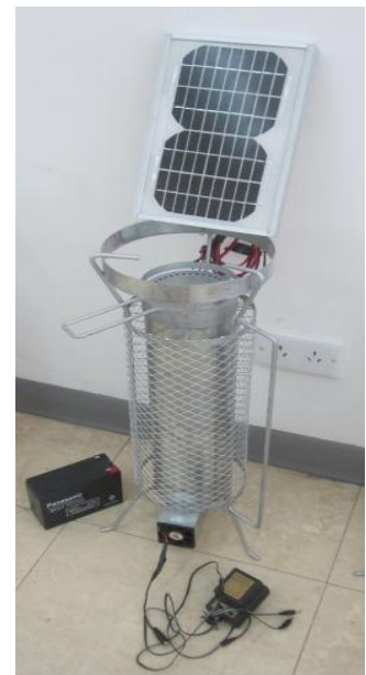
Solar and Battery for the Stove

Results of performance evaluation of the stove shown in table above revealed that in one load, it consumes 0.4 kg of rice husks within 18 to 20 minutes, depending on the input voltage of the fan that controls the flow of air through the fuel bed. Start-up time is almost 1 minute using burning pieces of paper. Two liters of water can be boiled in the stove within 12 minutes. A 200-g rice can be cooked within 15 minutes while 3 pieces of tilapia can be fried within 18 minutes. Moreover, the computed specific gasification rate of the stove is 114 \text{ kg/hr-m}^2 with a power output of 0.91 kWt. The stove has the following advantages: (a) easy to operate; (b) controllable flame intensity by simply adjusting the input voltage of the fan with the use of a switch located at the adaptor; (c) with light-blue colored flame indicating the gas burned is clean; (d) no smoke during operation; (e) safe to operate since it operates in DC power and at almost ambient pressure; (f) very minimal electrical consumption in running the fan; and (g) very affordable. In cases where grid is not available, the stove can still be used with a 12-volt battery or a 5-watt solar panel (see photo right side above) to energize the fan. The by-product in burning rice husks in the stove