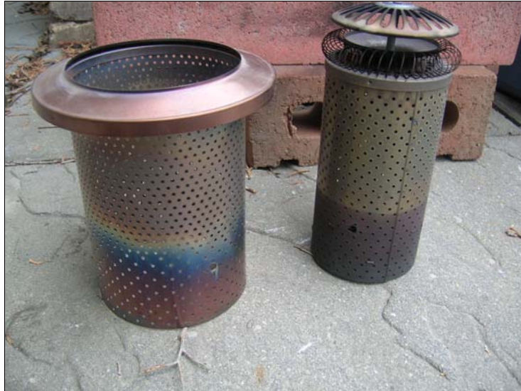
Fig. 1: Outer and inner chimney components

The Kero-Sun Radiant 10 (Type K, L, M) Kerosene Heater has a chimney that glows red hot when the heater is in operation. This heater can be operated indoors in a room with some fresh air to supply oxygen. The CO emission are low. The operator's manual can be found at www.toyotomiusa.com