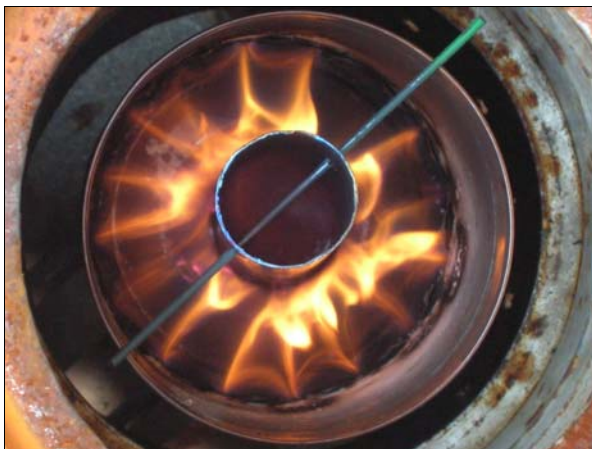
Figure A1. ConcBelow burner with a 2.5 cm diameter cylinder in the center, extending from the level of the concentrator ring, to the top of the chimney. Ten minutes after ignition, and red-hot fuel pellets can be seen through the bottom of the burner.