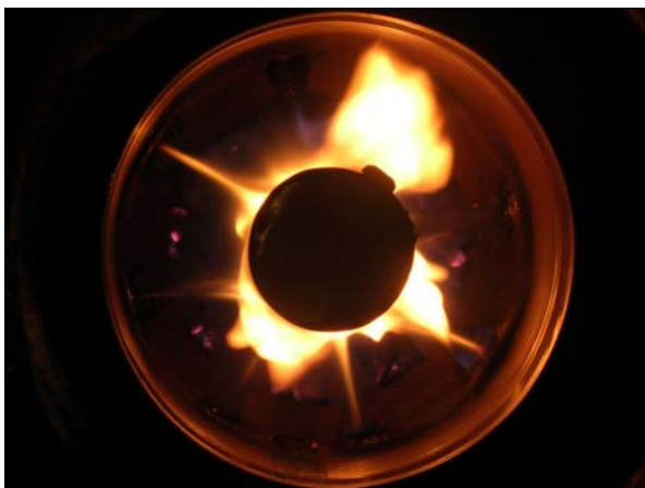
Figure A3. Rectangular Burner with a 2.5 cm diameter cylinder in the center. (darker light conditions than Fig. A1). Red-hot fuel pellets can be seen through the bottom of the burner.