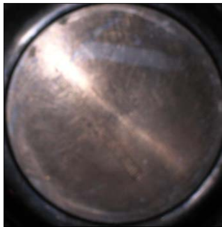
Figure A2. ConcBelow burner + central cylinder had low soot deposits similar to ConcBelow without the central cylinder (Figure 4).