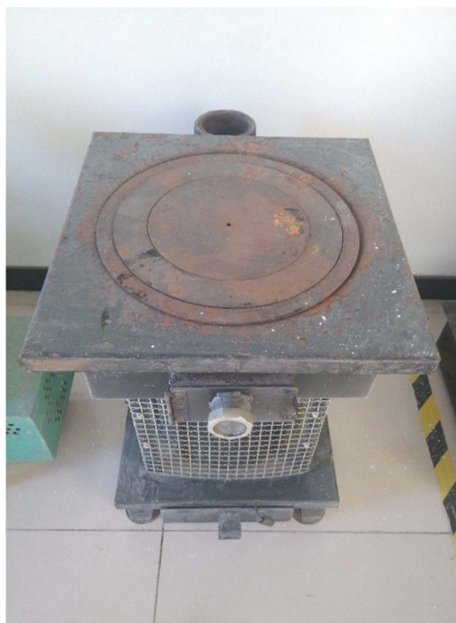
Fig. 2. Biomass cooking stove used in China.

Biomass stoves commonly used in other countries, such as Uganda, Laos, and Nepal are shown in Figs. 5–7, respectively. Most of those