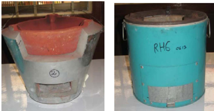
Fig. 6. Biomass stoves used in Laos.

a stove undergoing a test, the sequence of steps should be stipulated in detail. Fuel, stove and operator should be considered as a whole combined system when designing a testing method.