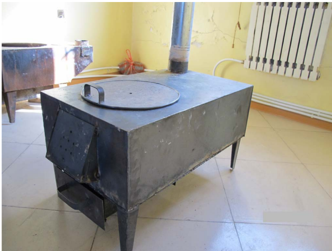
Fig. 4. Traditional stoves used in Mongolia.

chimney stoves sample directly from the stack. For stoves without chimney, it is common to collect the exhaust gases using a capturing hood, and then perform sampling from the diluted gas stream. A substantial difference in results has been reported when applying different standards and protocols [59]. Protocols designed for testing cooking stoves are often unsuited to testing space heating stoves.