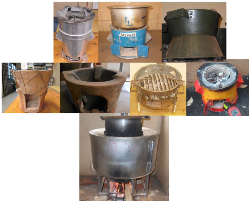
Fig. 5. Biomass stove used in Uganda.