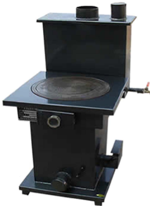
Fig. 3. Biomass cooking and heating stove used in China. Source: Collected during the 10th China Stove Exhibition held in Langfang, Hebei Province, China in 2016.

products are smaller compared with conventional Chinese and Mongolian stoves. Household cooking stove used in other countries were shown in Fig. 8.