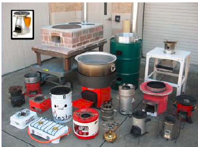
Fig. 8. Biomass stove widely used in developing countries.

gaps between laboratory and field tests (kitchen conditions) should be bridged so that results derived from two distinct testing locations are coherent. The existing laboratory-based stove tests usually cannot accommodate contextual cooking practices and field conditions. There is thus an urgent need to develop a testing method that will reduce or even eliminate the gaps between laboratory and field level outcomes. An essential component of this solution is to use locally relevant stove/fuel and behaviour combinations as the pre-requisite for testing. High-performance stoves do not function independently of circumstances. They must be powered with the correct fuel type for which they were designed.