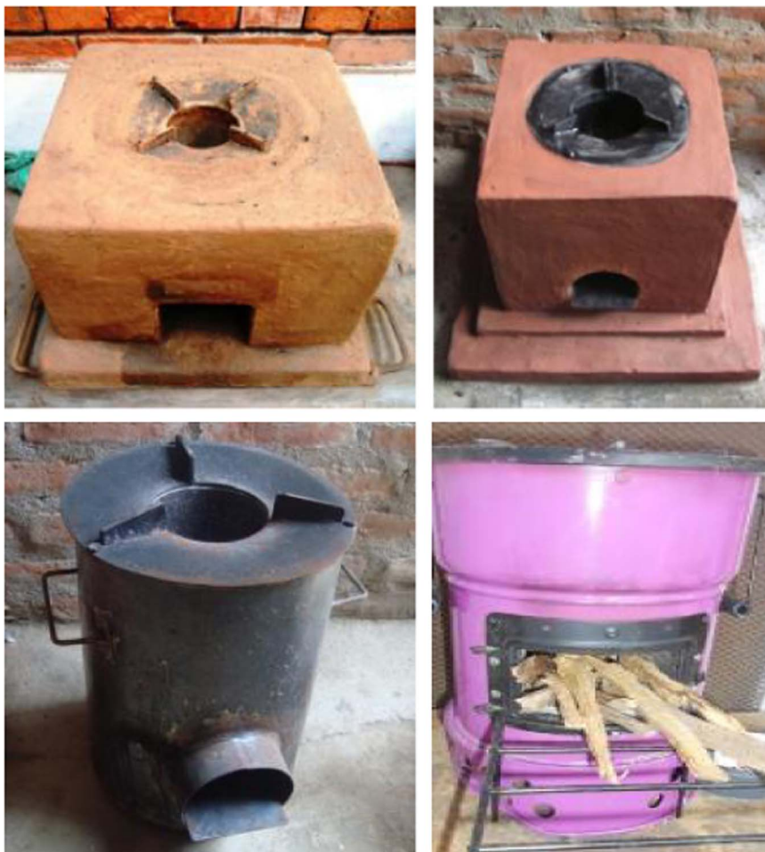
Fig. 7. Biomass stoves used in Nepal. Source: collected during Senior training program for Clean Future – Clean combustion technology and its application for rural households & 2014' Forum of Renewable Energy Promotion in Developing Countries, Beijing, China, 2014.

(f) During the development process of an acceptable standard, the